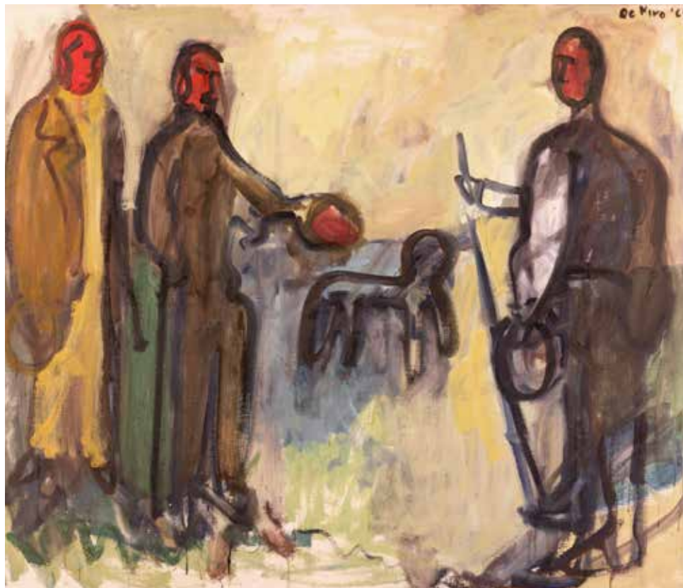
Gift from Robert De Niro (2020) On loan to Musée Fabre, Montpellier, France Robert De Niro Sr., Three Figures after Courbet, 1965

KBFUS ART operates under the guidance of our Art Advisory Committee, comprised of leading experts in the field. With their support, we make sure that donated artworks are displayed in the best possible environment, used in temporary exhibitions or made available for research, according to the donor's wishes and instructions.