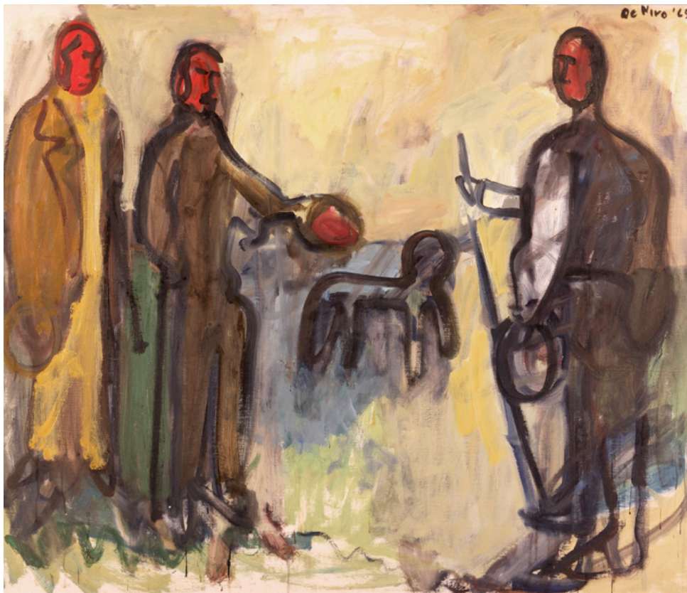
Gift from Robert De Niro (2020) On loan to Musée Fabre, Montpellier, France Robert De Niro Sr., Three Figures after Courbet, 1965

Myriad ART operates under the guidance of our Art Advisory Committee, comprised of leading experts in the field. With their support, we make sure that donated artworks are displayed in the best possible environment, used in temporary exhibitions or made available for research, according to the donor's wishes and instructions.