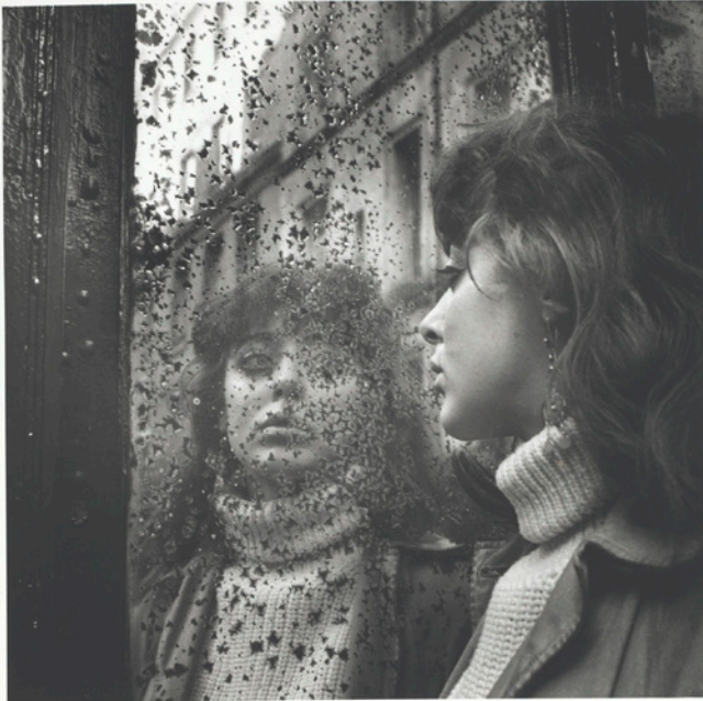
Ed van der Elsken 1952

When making a charitable gift of art, a donor may be eligible to receive an income tax deduction for the contributed item, but solely if the gift is made to a nonprofit institution based in the United States, such as Myriad USA. No deduction is allowed for lifetime gifts made directly to institutions abroad.