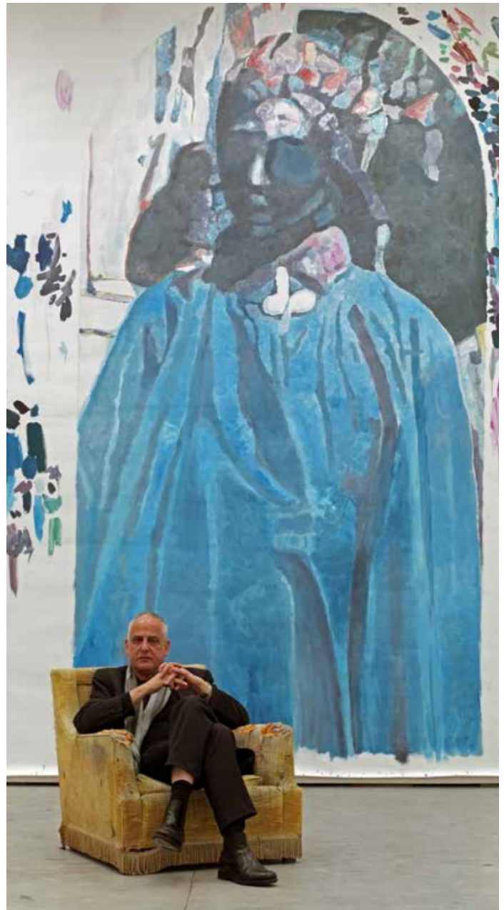
Gift from David Zwirner Inc. (2016) On loan to Royal Atheneum, Antwerp, Belgium Luc Tuymans, Munich, 2013

Myriad USA charges a management fee for all contributions of artworks, as follows: 5% of the first $100,000 of its appraisal value; 2% of the next $400,000; 1% of the next $500,000; and 0.5% of the appraisal value in excess of $1,000,000. A minimum fee of $2,500 applies.